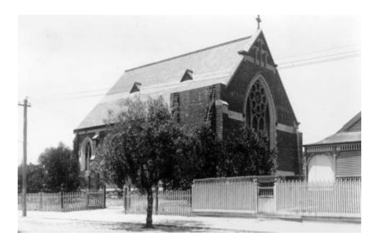
1906 St Andrew's Church at 257 Barker Road Subiaco c.1915 (SLWA 001177D)

At a later time (1921), Bastow listed his major works in WA as the Miners' Institute at Kalgoorlie (1902) [although this building may in fact have been designed by Harvey Draper], markets at Perth (1904), Mosey's Chambers in Barrack Street, Perth (1904), and St Andrew's Church of England in Barker Road, Subiaco (1906). In 1905 the new Perth Markets were in the course of erection. The new general produce wholesale and retail markets built on four acres of land at Charles, Duke and John Streets in Perth were to be ready early in December 1905, valued at around £4,000, but the whole plan was for an outlay of about £20,000.