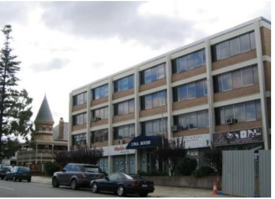
1904 Hassell residence Kendenup in Hay Street, West Perth, and at right, the building that replaced it. Meerlinga at the left is extant.